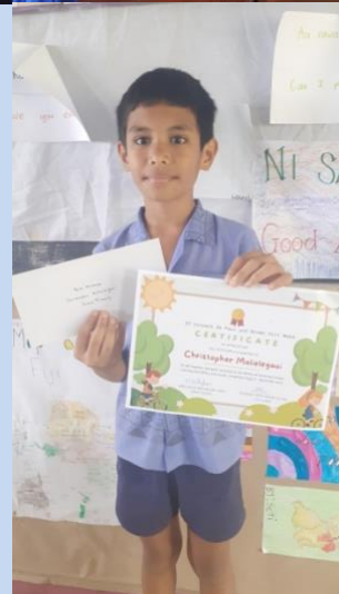
WINNER OF SAFETY POSTER COMPETITION