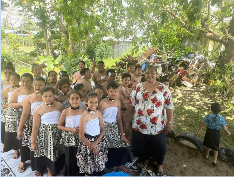
The children and the choreographer are ready to rock the stage. TEINE MAI FITI.