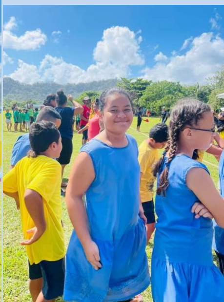
Malo lava le taalo male tapuai.