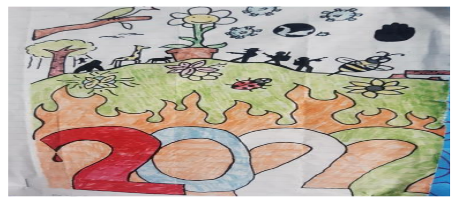
ENVIRONMENT OF 2022